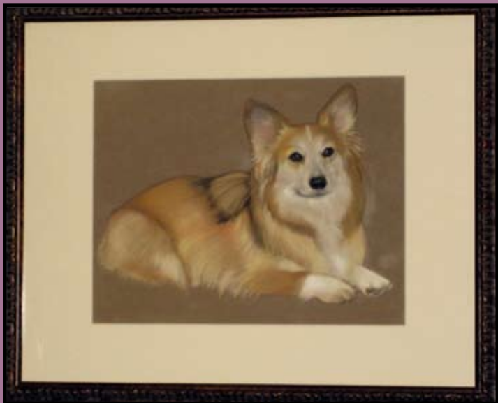
CUSTOM PORTRAIT OF YOUR CORGI by Leighanne Dees (pastel painting, matted/framed measures 16x20)